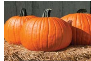
Answer: A fruit!

Americans eat about 46 million turkeys each Thanksgiving.